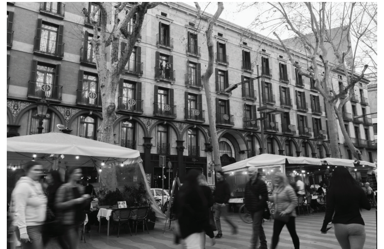
Hotel Oriente, 2020, Rambla dels Caputxins, Barcelone, Espagne