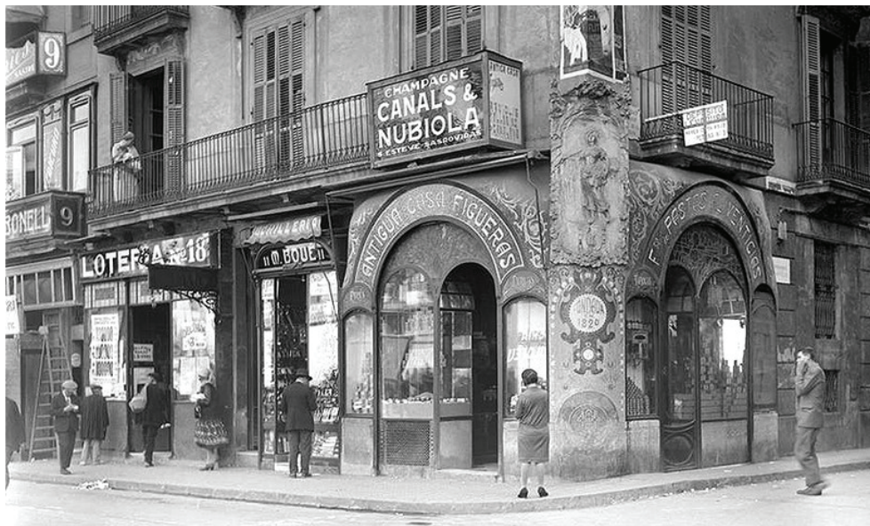
Patisserie Escribà, 1986, La Rambla, 83, 08002 Barcelona, Espagne