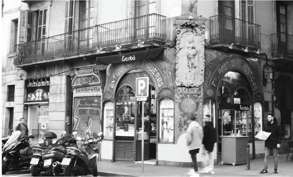
Patisserie Escribà, 2020, La Rambla, 83, 08002 Barcelona, Espagne