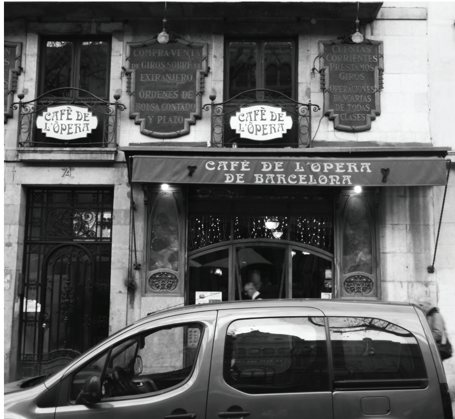
Café de l'Opera de Barcelona, 2020, La Rambla, 74, 08002 Barcelona.