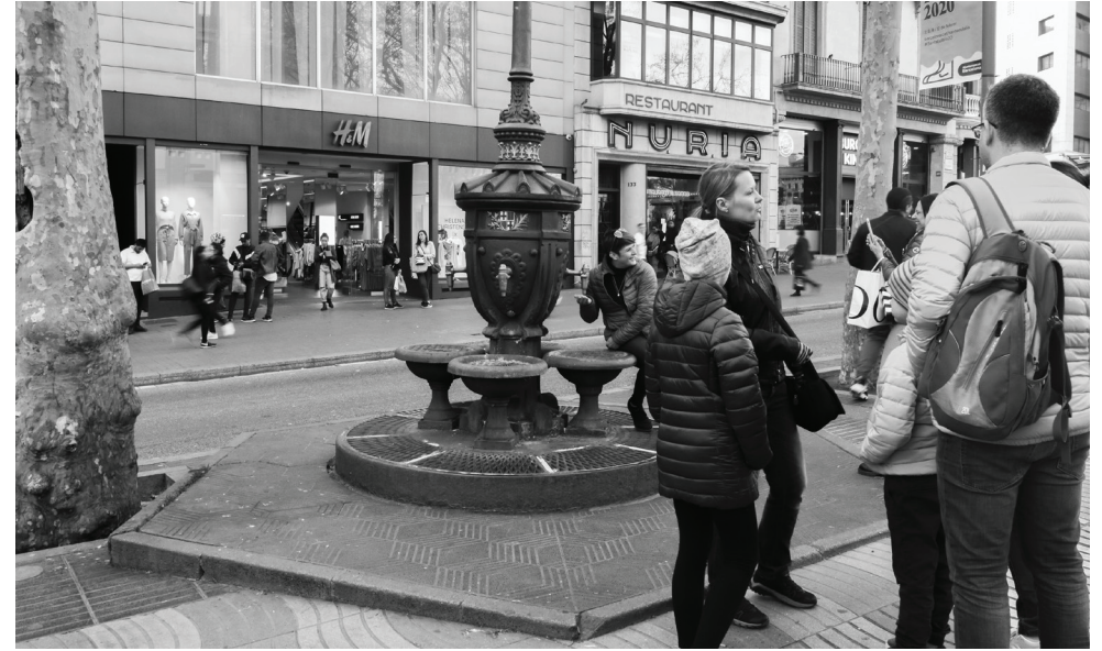
Font de Canaletes, 2020, La Rambla, 133, 08002 Barcelona