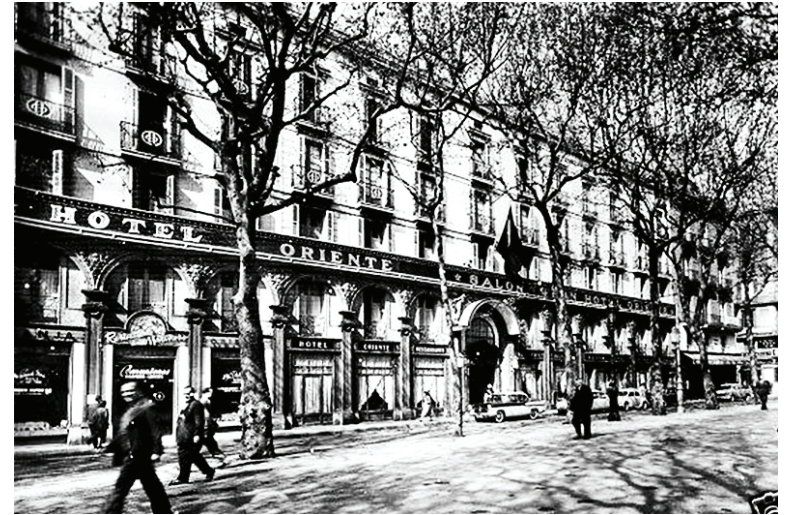
Hotel Oriente, 1931, Rambla dels Caputxins, Barcelone, Espagne