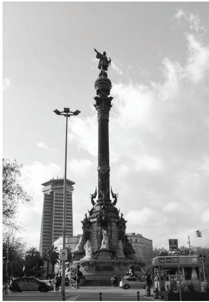
Mirador de Colom, 2020, Plaça Portal de la Pau, Barcelona