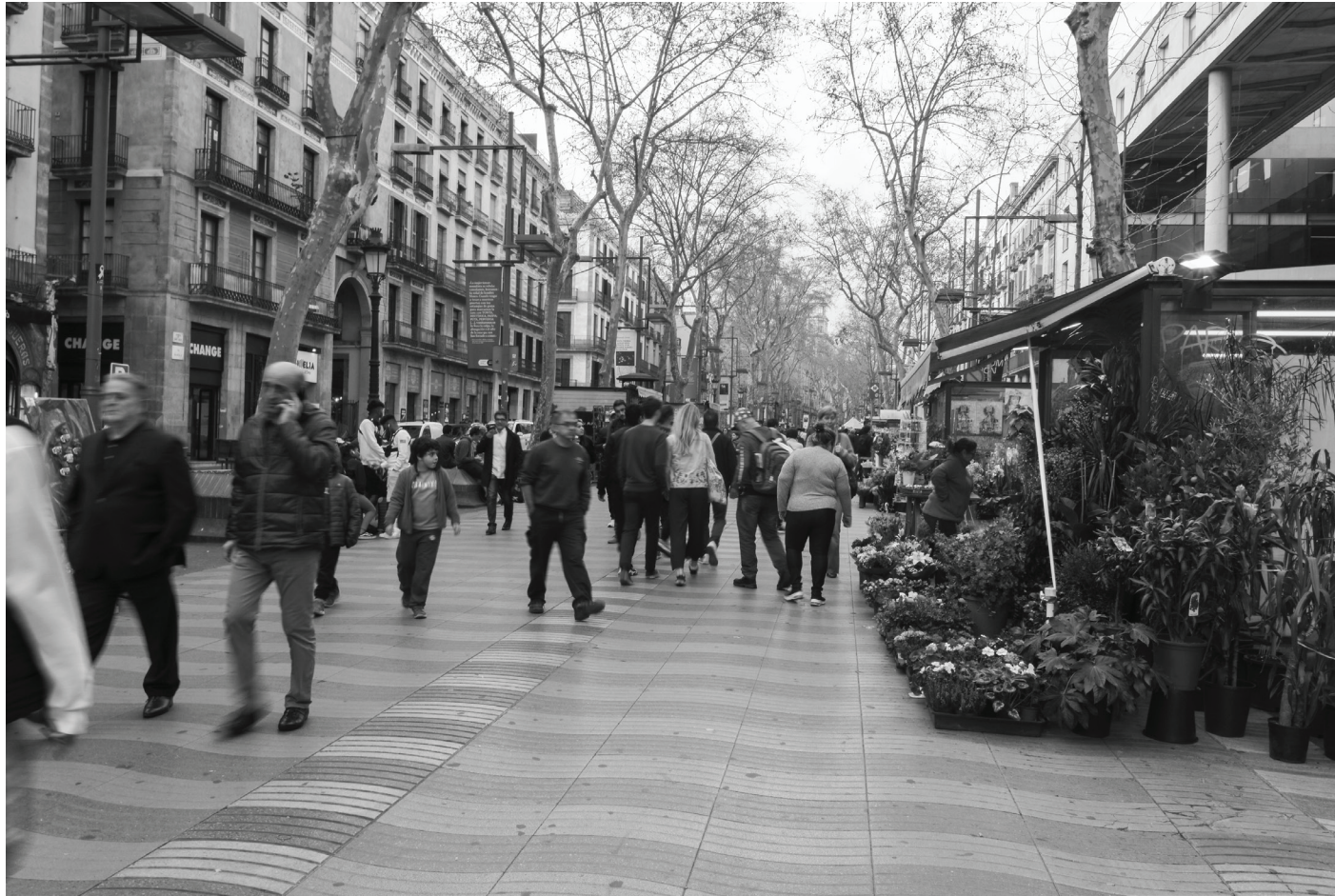
La Rambla de Sant Josep, 2020, 08002, Barcelona