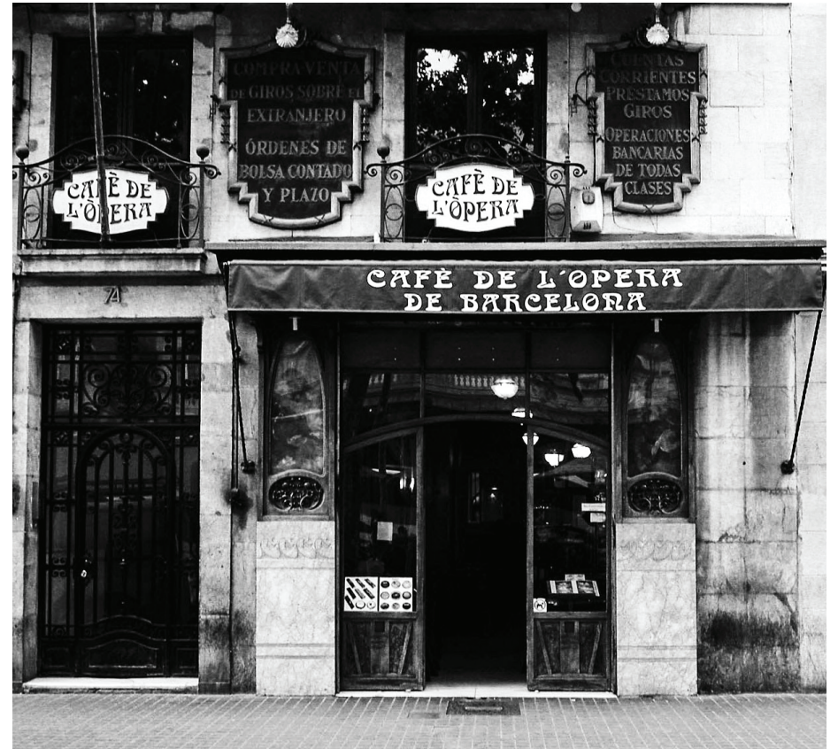
Café de l'Opera de Barcelona, 1974, La Rambla, 74, 08002 Barcelona.