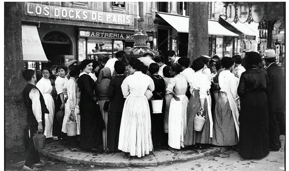
Font de Canaletes, 1925, La Rambla, 133, 08002 Barcelona